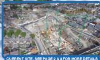
CURRENT SITE, SEE PAGE 2 & 3 FOR MORE DETAILS